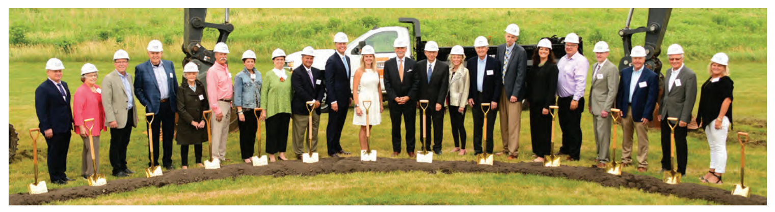
Learn more about the project and fundraising campaign at www.mercycare.org/services/hallmar-village

The Mercy Foundation is also establishing the HallMar Village Benevolence Fund. The Foundation hopes to raise an additional $250,000 to support HallMar's most vulnerable residents, those with limited income and those that outlive their resources. The desire is to help seniors stay in their HallMar Village homes even if their financial situation changes. With us, they can continue to receive the highest quality and most advanced care possible.